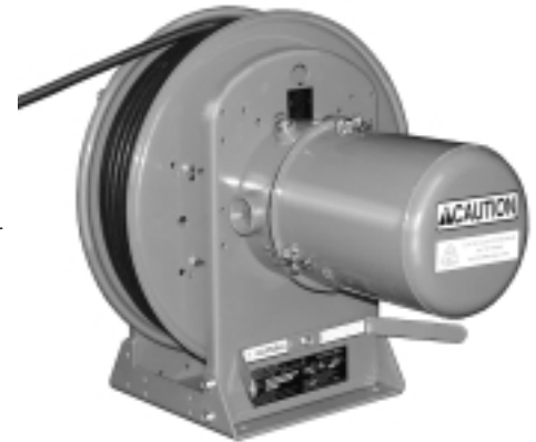
Cable payout, as pictured above, denotes reverse rotation.